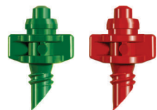
1.3 mm 1.5 mm