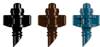
0.8 mm 0.9 mm 1.0 mm