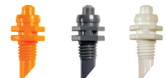
1.8 mm 2.0 mm 2.3 mm