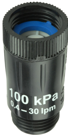
Pressure Regulator 100 kPa