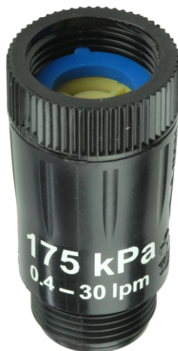
Pressure Regulator 175 kPa