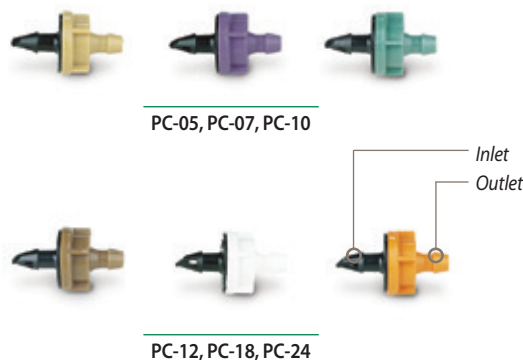
PC-05, PC-07, PC-10