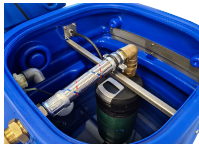
PLUG & PUMP Fully integrated system, inverter, sensors, non return valve, expansion vessel and isolation valve

DIMENSIONS Width 580mm Height 895mm Depth 747mm Weight 39 KG dry