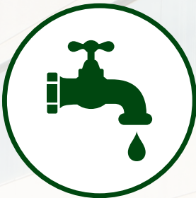
Sinks & Taps