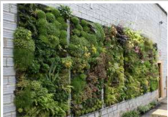
Example of vertical garden