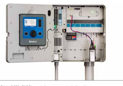
Metal Wall Mount (grey or stainless)