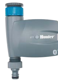
BTT-101 Inlet diameter: 3/4" and 1" Outlet diameter: 3/4" Height: 16.8 cm Width: 12 cm Depth: 6 cm

The Bluetooth® word mark and logos are registered trademarks owned by Bluetooth SIG Inc. and any use of such marks by Hunter Industries is under licence. iOS is a trademark or registered trademark of Cisco in the U.S. and other countries and is used under licence. Android is a trademark of Google LLC.