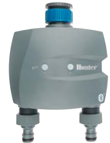
BTT-201 Inlet diameter: 3/4" and 1" Outlet diameter: 3/4" Height: 15.7 cm Width: 13.5 cm Depth: 7.6 cm