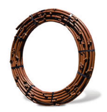
QF Dripline Header