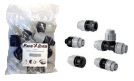
XQF compatible fittings