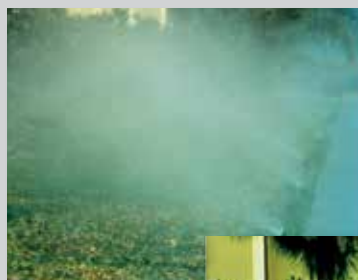
Without Pressure Regulation