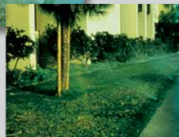
With Pressure Regulation