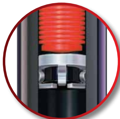
Patented X-Flow® Shut-off Device

Up to 40 gallons of water per minute can escape through a spray head that has a missing or damaged nozzle. This wasted water can lead to landscape erosion, property damage, or unsafe conditions due to wet hardscapes. The patented X-Flow device is factory-installed in the riser and holds back over 99% of the water that would otherwise be wasted in cases where the nozzle has been compromised through unintentional accidents or vandalism. Furthermore, X-Flow technology allows for spray head maintenance or component replacement without the need to turn off the system.