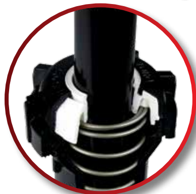
Enhanced zero flush seal

System start up is a critical time when water waste can occur. The Toro 570Z Series spray head's wiper seal is pressure-activated and prevents flow-by at start up, meaning no water is wasted and more heads can be installed on the same line.