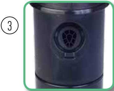
Nozzles Geometry on the face of the nozzle creates breakup.