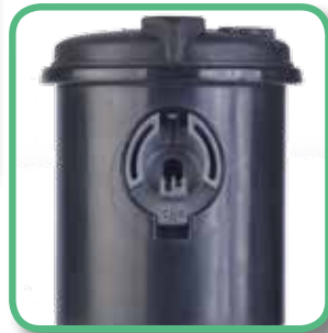
Stream straighteners align the water flow behind the nozzle.