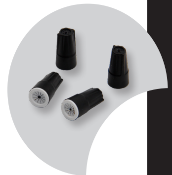
Waterproof wire connectors included