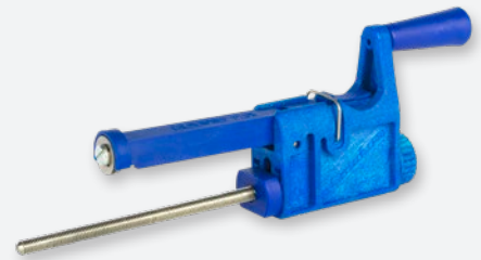
Calderprep™ Plus Rotary Scraping Tool