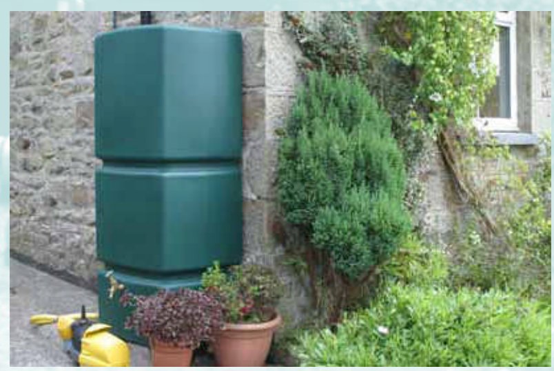
Filter Collector available in Grey, Black, White and Brown

Powerful garden pump with pressure switch available